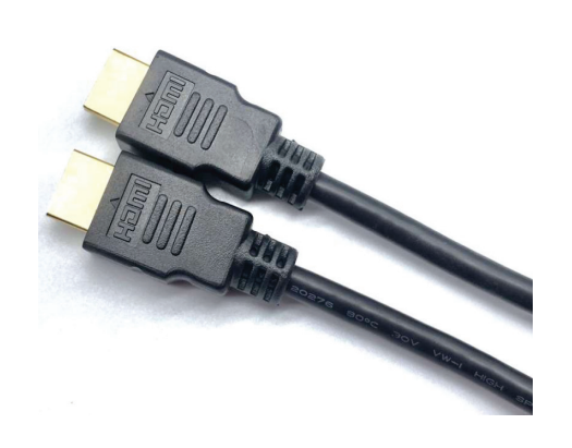
Cat. No: HDMIHDR-20